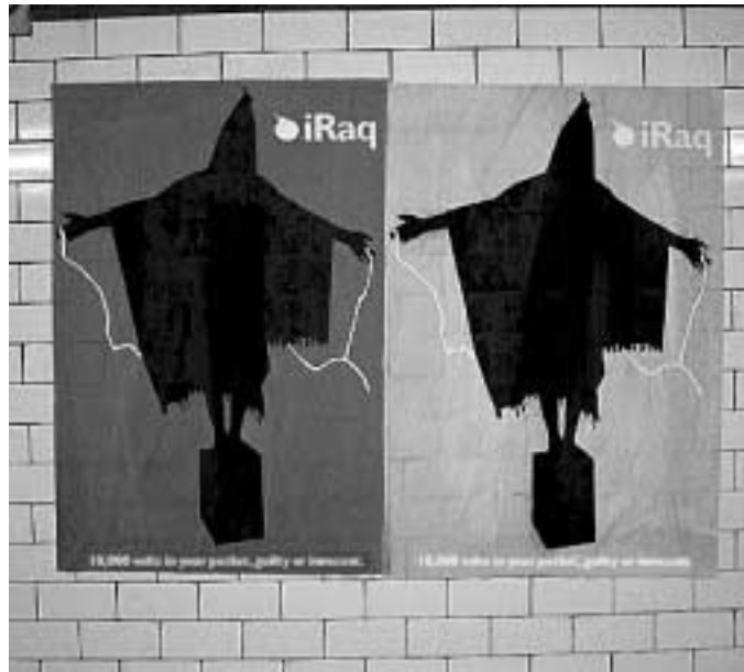
iRaQ: Culture Jammers spoof iPod ad in a New York subway station.

Many people are re-examining the Stanford Prison Experiment conducted in 1971. A group of 24 college students were randomly divided into two groups of guards and prisoners, and then placed in a simulated prison to study the psychological effects of becoming a prisoner or a prison guard. The "prisoners" were subjected to disorienting and humiliating techniques, such as stripping and blind-