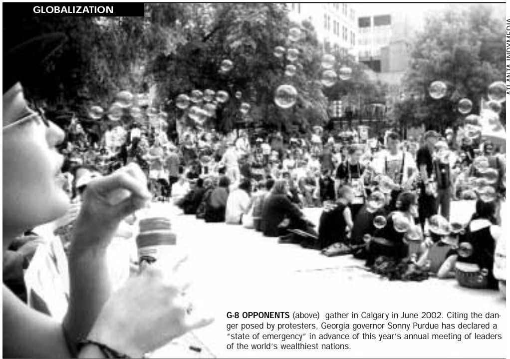
G-8 OPPONENTS (above) gather in Calgary in June 2002. Citing the danger posed by protesters, Georgia governor Sonny Purdue has declared a "state of emergency" in advance of this year's annual meeting of leaders of the world's wealthiest nations.