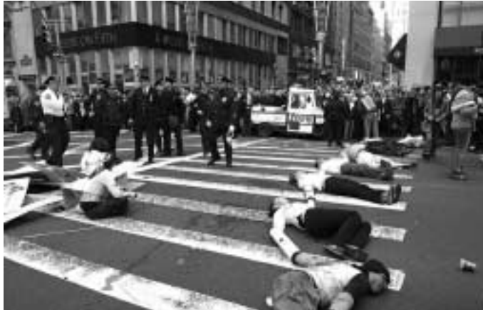
SLEEPING DRAGONS AWAKE: In the aftermath of Rachel Corrie's killing by the Israeli military in March 2003, protesters "locked down" in the Diamond District.

The activists were part of a larger group of 16 New Yorkers arrested March 26, 2003, during a