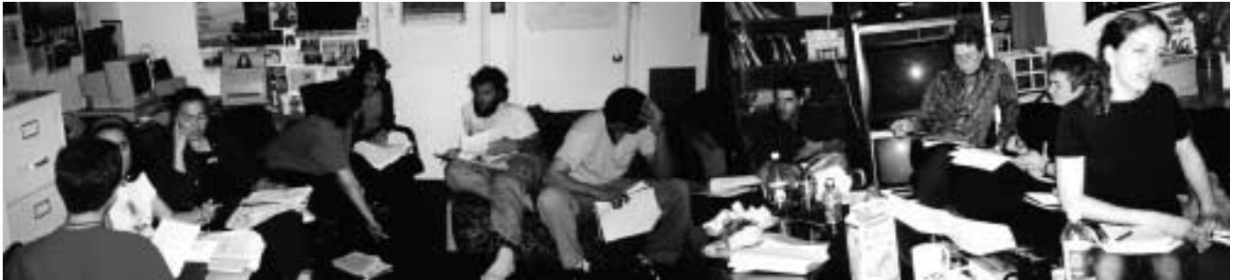
Aspiring reporters discuss how to cover the news during a May 2002 community reporting workshop. Nearly 200 people have participated in The Independent's reporting workshops since they began in the fall of 2001.

need to have multiple articles by the same author on the same page?" Donald Paneth asks, "What's the big picture in this issue? Why do we have so much trouble managing our information?"