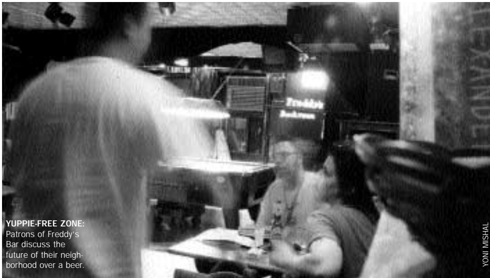
YUPPIE-FREE ZONE: Patrons of Freddy's Bar discuss the future of their neighborhood over a beer.

POPULAR PROSPECT HEIGHTS WATERING HOLE COULD BE REPLACED BY ONE OF RATNER'S ESCALATORS