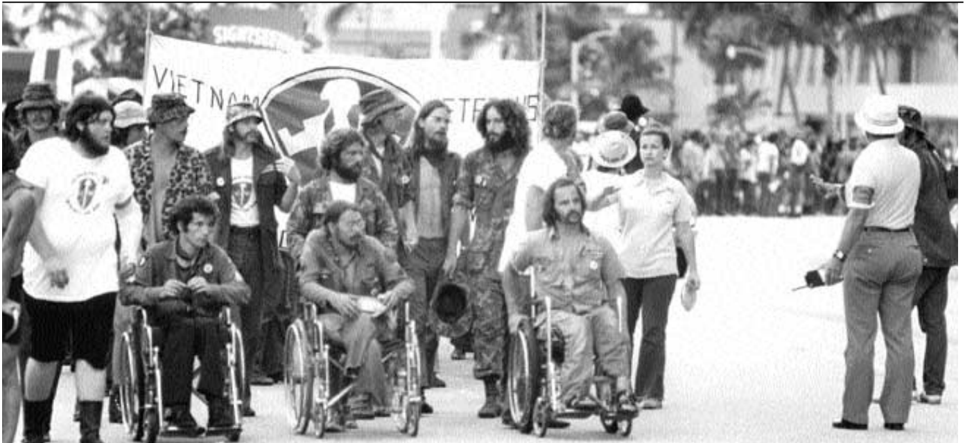
Vietnam Veterans Against the War, including Ron Kovic (in wheelchair far right), make a showing at the Republican National Convention of 1972.